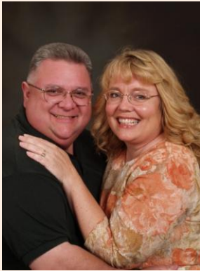
Speaker: Minister Danny Arroyo