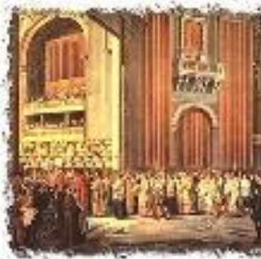
Third General Council of Constantinople - Harun Yahya

680: The third Council of Constantinople (6th ecumenical council) opened. The conclusion of the council was that Jesus has two wills as well as two natures (divine and human), and that those two wills did not conflict with or strive against each other. It thus refuted the heresy of monothelism , which held that Jesus Christ had only one (divine) will.