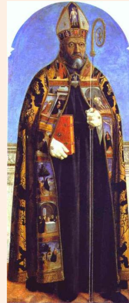
St. Augustine of Hippo

354: Birthdate of Saint Augustine of Hippo, the greatest of the Early Latin Church Fathers. Of his many writings, two have endured: "Confessions" describes the circumstances leading to his conversion to the Christian faith, and "The City of God," which is a Christian view of the sacking of Rome by the Visigoths in the year 410.