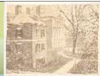
Pine Building, Pennsylvania Hospital, c. 1861