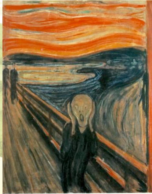
“The Scream,” a painting by Edvard Munch, could represent what “Culture Shock” feels like.